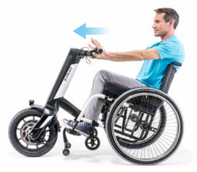
2. Press forward to lock into position and go.