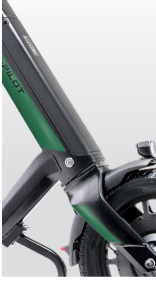
<sup>1)</sup> Colours shown may differ from the original due to printing deviations. We reserve the right to change colour selection according to availability.