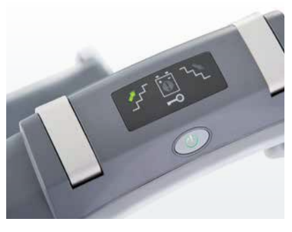
Display showing all functions at a glance