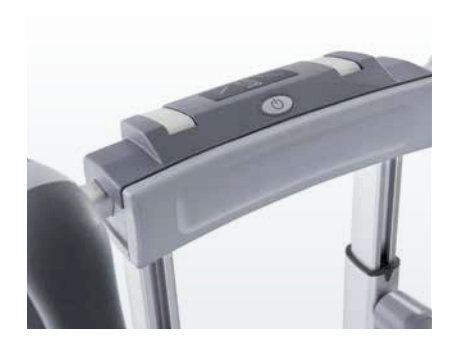
Comfortable cusioning: for resting the operating unit on the thigh