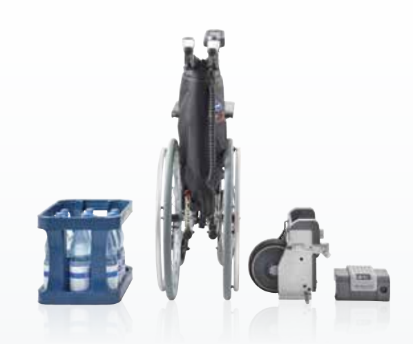
viamobil – small, light, handy and easy to transport