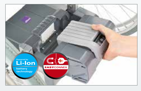
Insert the battery pack effortlessly. It's simple and safe.